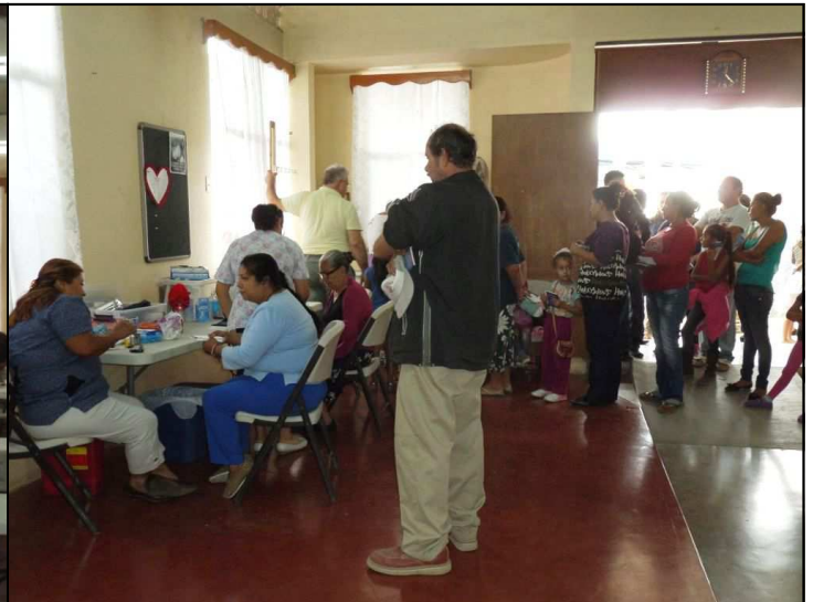
People lining up to have their vital signs recorded, before they see a doctor, a dentist, or receive glasses, etc...