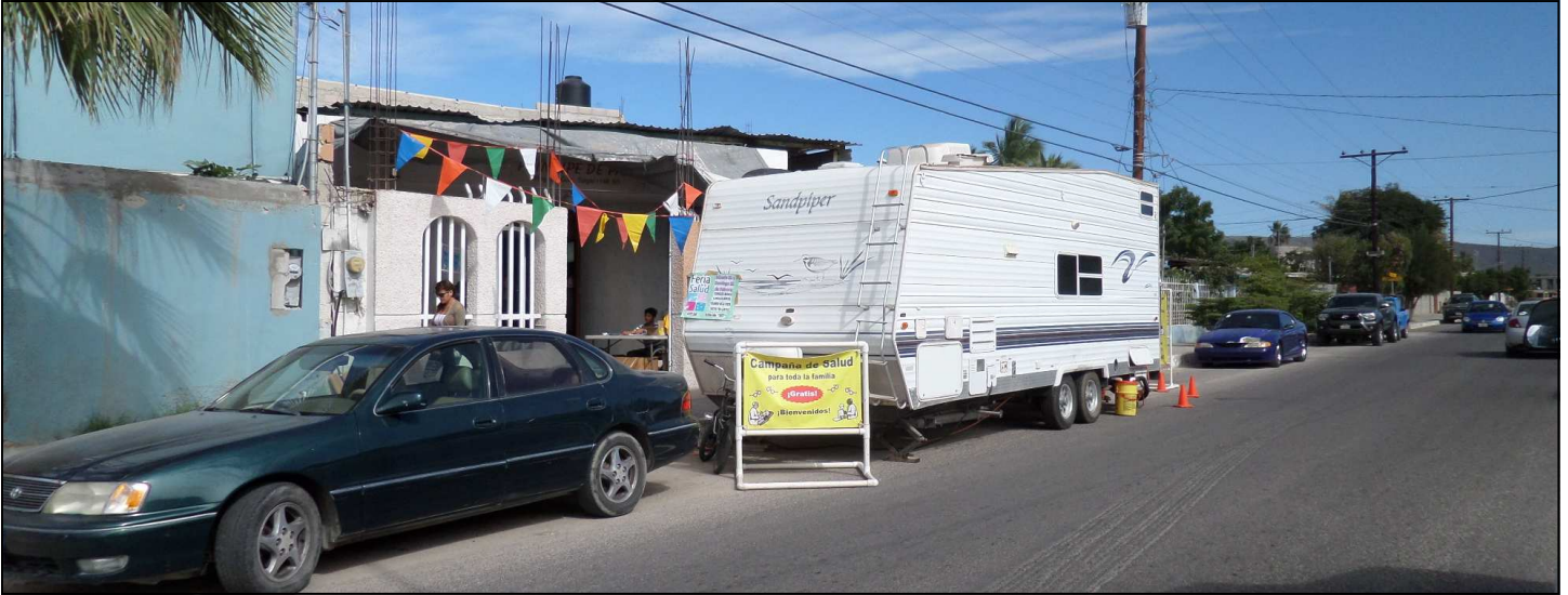
This is the church we were at in La Paz this weekend - on a busy street - with our dental trailer parked in front...