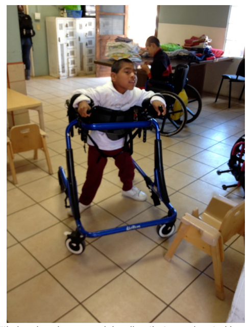
This little boy is using a special walker that was donated by a couple whose son passed away. This special equipment has proved to be a blessing to several of the kids, giving them mobility they did not have before.

A highpoint of this first month has been getting to know some of the kids better and discovering activities that they enjoy. In the two pictures below, the boys are making use of equipment that was donated to Gabriel House. We are grateful for those who remember our kids this way. I would love to have more instruments for the kids to explore, if any of you have something sturdy that is not being used.