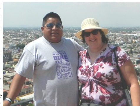
Above: Visiting the city of Cholula near Puebla