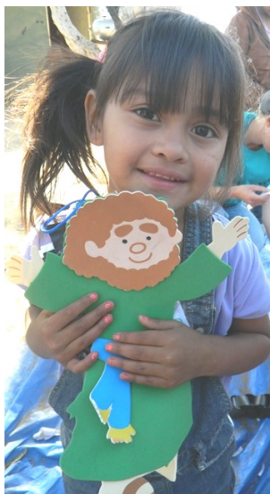
Above: The Paul craft from VBS

We have been involved in VBS, film ministry, and have been in Camp Vergel going door to door to hand out CDs and DVDs of the gospel to people in their native dialects. We have also gone to assist at the Buen Samaritano Retirement Home.