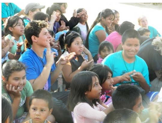
Above: VBS in San Simon Abajo

We have worked with teams from Idaho, New Hampshire, and Oregon. It has been exciting to meet and serve with new people, as well as old friends.