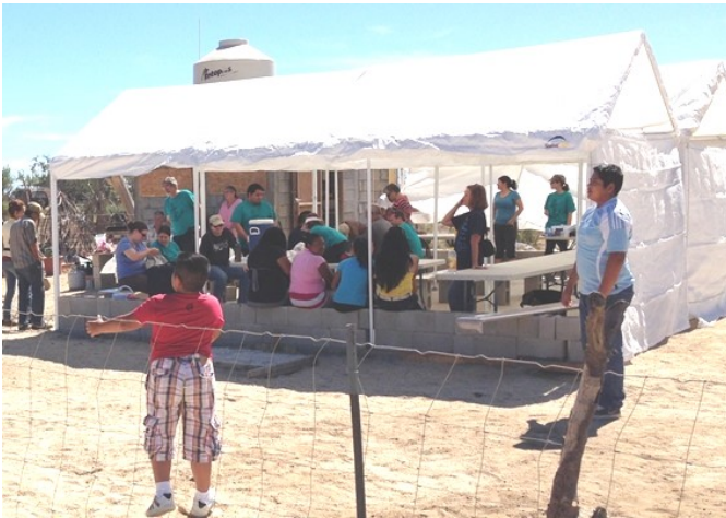
Above: The second church where we held a health fair.

community, and food staples for the pastors to distribute. At one church that had been partially destroyed, the team took out the old platform and put in a new, bigger one. At the second church, we held a health fair with doctor's consults, eyeglasses, foot washing, and vital signs.