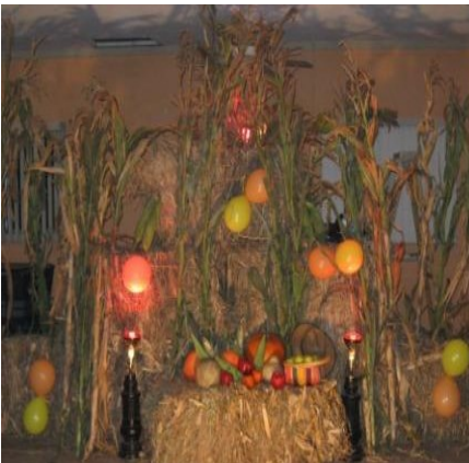
Above: Decorations at the harvest festival. Below: Contestants in the Biblical costume contest.