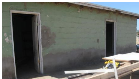
Above: The building that is being transformed into a cafeteria. Below: Team from Dunntown Advent Christian Church putting up drywall.

converting a building into a cafeteria, so the men installed drywall at the school. The following week we went back to talk to the principal to see if she was pleased with the completed project. It turned out that she was overjoyed, because the government came to inspect the building, and since they had seen work done on the building (the drywall the guys had put up), the government decided to take on the project and had sent a crew to finish the cafeteria. The principal said that the money would have gone to another school if our team had not started working on the building. We are amazed at how God had the team at the right place at the right time!