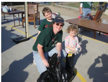
Tear down and clean up crew