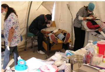
Dental care was given to 248 and 858 prayed to receive Christ as their Savior this year in Tijuana.