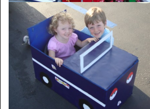
Drive in Movie Night at Awana