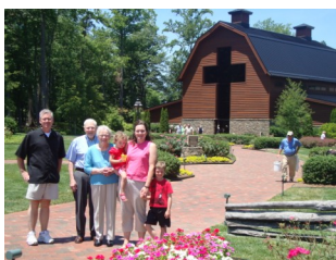
AC Triennial Convention We represent Mexican Medical at several conferences each year.