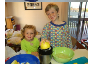
Squeezing lemons for the second annual lemonade stand