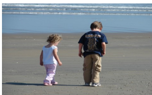
Kids at Staff Retreat