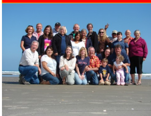
Mexican Medical staff & missionaries at Staff Retreat