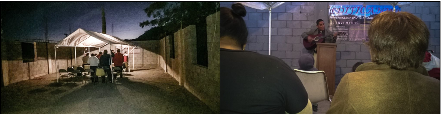
On Sunday night a few of us got together to praise the Lord for a wonderful weekend - they were all so excited about this Outreach!