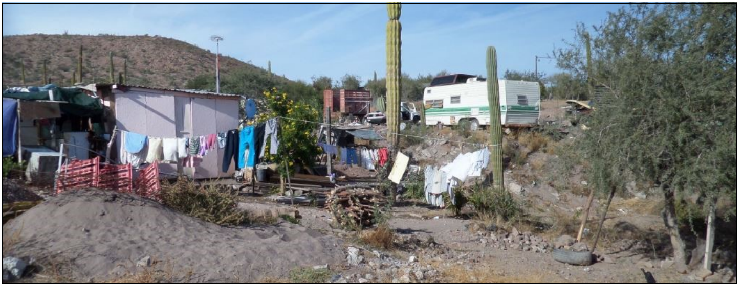
And this is the neighborhood that the church is in—in a new neighborhood of Loreto...