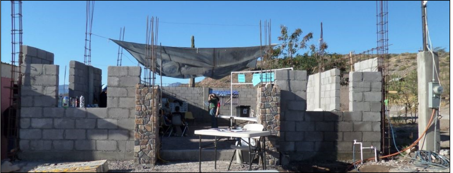
Yes, this is the new church we were at with our with our Heath Fairs this weekend...