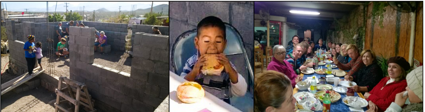
Lunch is served in what will be the Pastor's new 350 sq. ft. home..., and then the team went out for dinner on Saturday night...