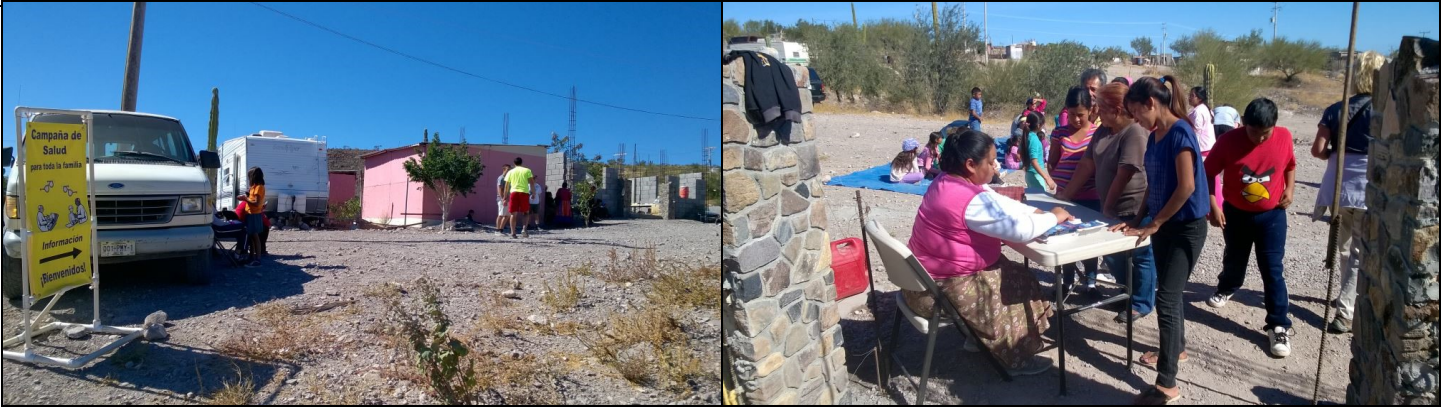
Our dental trailer can be seen beside the ‘Sunday School Room’, and people lined up at our Reception Table...