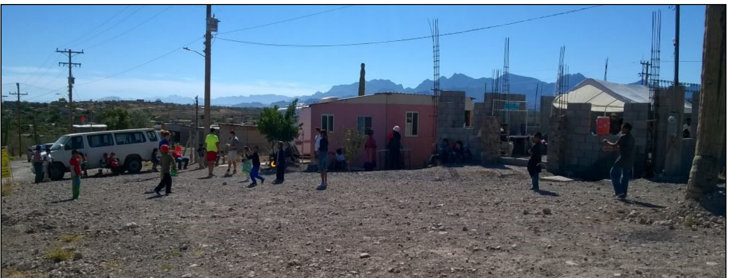
People came from all around the area, and the children really enjoyed playing with our students from Pennsylvania...