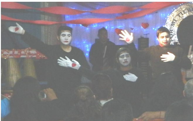
Above: The youth team presents a mime about the love of Jesus at the church on Valentine's Day.

Please pray for these youth as they continue to minister through mime and drama. After witnessing the youths' enthusiasm in this ministry, we felt it was confirmation to continue forward in the construction of the youth center, so that the youth from our community will have their own space to fellowship and grow in their relationship with Christ.