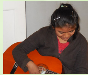
Flor practicing guitar.