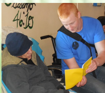
Interactions during our visit to the Senior Home.

I feel so rich to have worked alongside this team from Oregon as the light of Jesus just radiated from their hearts and faces.