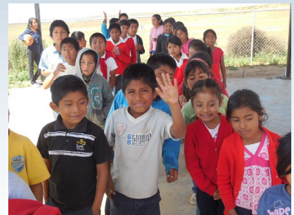
Students in line for their ditty bag.

Praise & Prayer - I received a donation specifically for purchasing a vehicle. I am hoping to find a 2008 Ford Escape (Compact SUV) with low mileage. I would appreciate your prayers for the car hunt.