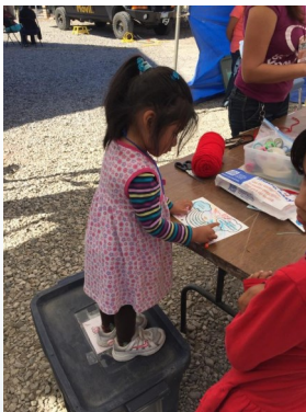
A step up during VBS craft time in San Felipe.

San Felipe – In early March, I was afforded the honor of joining a team of 19 Americans from California and 19 Mexicans from Tijuana who traveled together to San Felipe to offer health fairs in two different communities. (San Felipe is located on the Sea of Cortez side of Baja about 5 hours south of the border.) In each location we partnered with several churches already existing there to bring free medical and spiritual care to the poor. We offered all levels of dental care (including one surgery), doctor consults, medicine, foot care, haircuts, reading glasses, blood pressure and sugar level checks. All these services gave us an opportunity to offer spiritual care through sharing the gospel and praying for both adults and children in a variety of venues. Between both days there were 111 adults receiving Jesus for the first time. We are praying for the pastors and their churches as they follow up with these new believers.