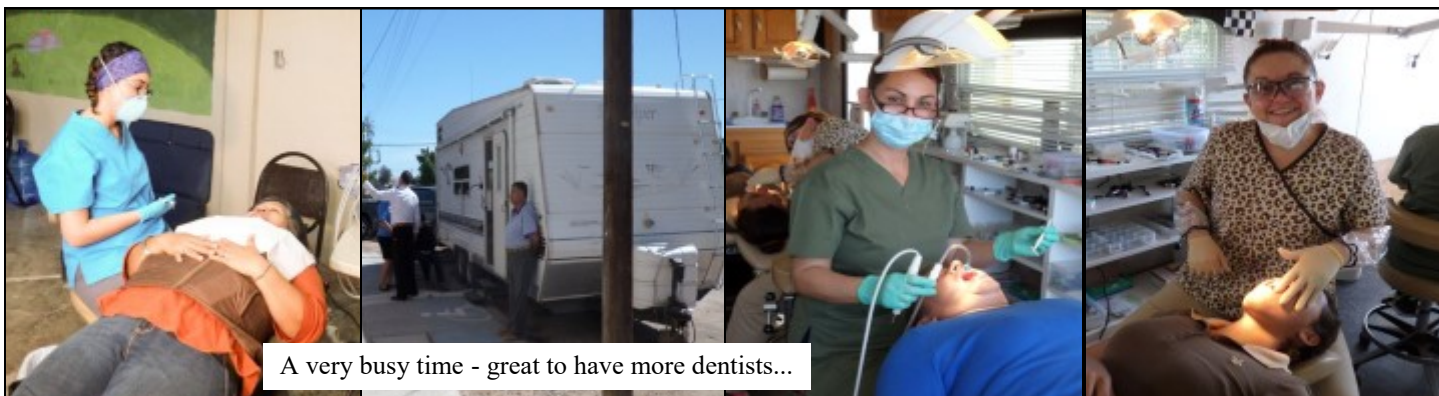
A very busy time - great to have more dentists...