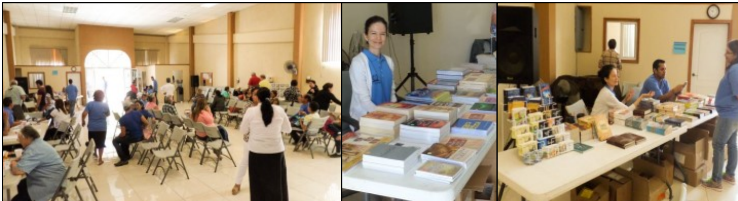
While people wait their turn to see a doctor or a dentist, or to receive glasses, many come to our Bible and book table...