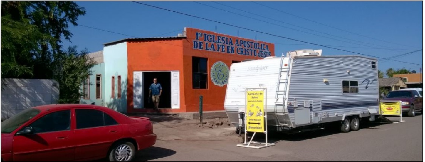
This is the church we were at here in Loreto, with our dental trailer parked in front...