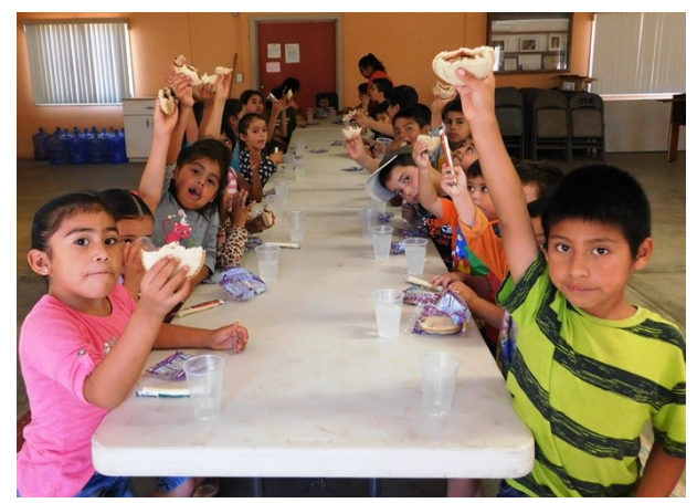
Above: The kids raise their PB&J to the sky. Other snacks included were pretzels, yogurt, and string cheese! What a treat for the kids!

We are thankful for the donation of a van and snacks for the Saturday Kids' Club this fall!