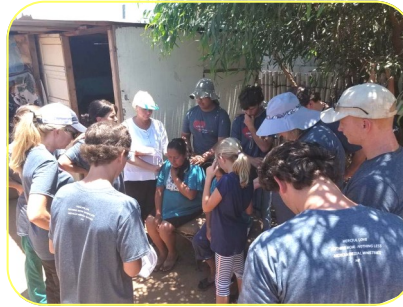
Alabama team praying for a family outside their home.

* Prayer teams/translation I had the privilege to lead several teams out into the community to pray for those the Lord led us to and to translate for the teams. On one occasion we went to the local hospital, and while some of the team walked around the outside of the facility praying, some of us went inside. We started in the waiting room by sitting with those who were there and starting up conversations, which eventually led us to praying for many. Later, I led another team back to where the patients were. There was only one patient there, who had just had surgery. She is a diabetic and had been working in her garden when she stepped on a nail that pierced through her foot. With no feeling in her feet, she did not even realize it until she went into her house and could hear a clanking noise every time she stepped. Her surgery went well. The Lord saved her toes and foot and she was healing well. We prayed for her and her family who were there visiting. Next, we asked the nursing staff if we could pray for them. They were overjoyed to receive prayer and all gathered together. Wow, the light of heaven was shining on us as we prayed. Finally, the nurses asked us to pray for the hospital administration, so they took us to the back office. As we prayed, something heavy lifted off.