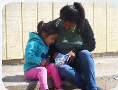
Nail salon time.