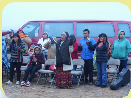
Our church worshipping on Easter morning up on a nearby hill.

We have been ever so busy this spring in our church here. Among some of our activities were a sunrise Easter service we held on one of the nearby hills, where we could view our whole village and valley as we celebrated Jesus' Resurrection. Though we did not witness the sunrise due to the cloud cover, we built a fire to stay warm and shared a meal afterward. Another time, we hosted a gathering of five churches, where we had an amazing time of worship, teaching, ministry, and fellowship together. One day a week, some of us women gather in our prayer room to pray and intercede for our church and village. Also, the Bible school continues to have classes on Mondays and Tuesdays. Next, we most recently celebrated Mother's Day, where the youth served a meal and put on an amazing drama. I saw several of the women with tears streaming down their faces. Furthermore, I am watching new believers come into our church and grow. I am witnessing families being healed by their encounters with Jesus. What wonder!!!