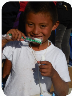
Learning about proper oral care.