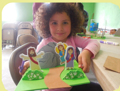
Jesus' resurrection craft.