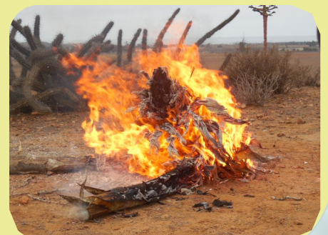
An old cactus became the fuel to keep us warm on Easter morning..