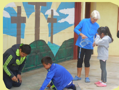
Giving living water.