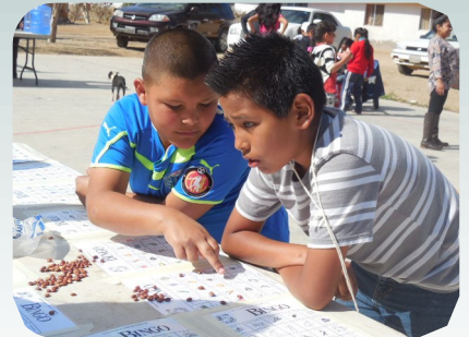
Boys learning about healthy foods while playing bingo.