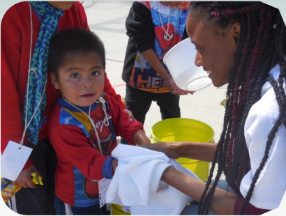
A little one enjoying hand washing.

Our last spring team came to us toward the end of May. As part of their nursing school curriculum at California State University Bakersfield, their professor brought nine of her students to experience on-the-field training. Joining us were the Bible school students from our site at La Esperanza. We held health fairs in three different locations. For the adults, we offered blood pressure and glucose screenings, reading glasses, diabetes education, and foot care. For the children, we provided health education in ten areas through a variety of games, teaching, and interactive experiences. Of course, one of these areas was regarding spiritual health, where the gospel was shared. By our last day, sixteen children had prayed to receive Jesus into their hearts. After visiting all ten stations, each child received a handmade cloth bag filled with hygiene items. Over the course of three days, we served approximately 175 children and 85 adults.