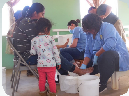
A little one watching her Mom receive loving foot care.