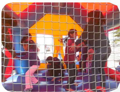
Girls turn in the bounce house.