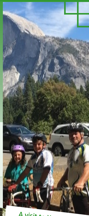
A visit to Yosemite

With grateful hearts for all God has given us, we joyfully share these moments with you.