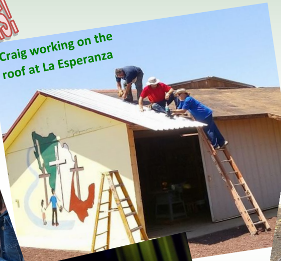
Craig working on the roof at La Esperanza