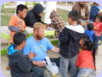
Vacation Bible school encounters.