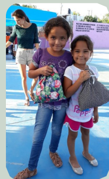
After teaching, games, and craft, these girls are grateful for the gift bags they received.