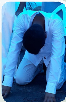
New believers being loved on by their community as they prepare for baptism in the Sea of Cortez.