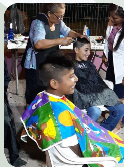
Neighborhood youth enjoying being cared for through hair cuts.