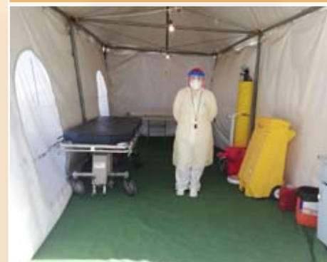
Triage tent at Hospital El Buen Pastor

We need your continuous prayers because all of us are in a mighty spiritual battle, but God fills us with joy doing His will. Thank you for what you mean to us all!