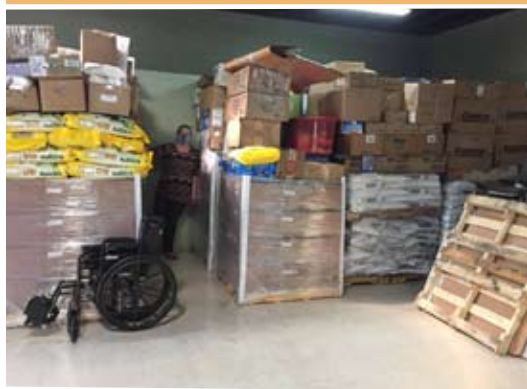
Food to be shipped to Cuba

Cuba has had major food supply issues for some time--shortages, high prices, long lines, and other difficulties. In addition to these ongoing issues, the economic situation is especially grave right now, in part due to pandemic-related shutdowns.