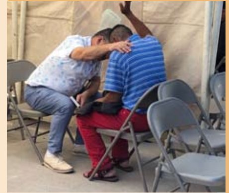
Prayer Tent at TJ Outreach

It has been a great year as we continue serving with our Mexican partners, provide needed supplies, and help lead people to their Savior. We look forward to what God has in store for 2021!