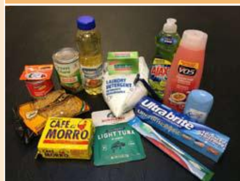
Relief kit to be distributed in Cuba

We ask you to join us in praying that this approval will be granted quickly, as well as for favor with officials, smooth transit, and that many lives in Cuba would be impacted for eternity through this tangible demonstration of God's love and care.