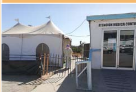
Triage tent next to Hospital's pharmacy

The regional federal government hospital asked us if we could receive their obstetric emergencies, as their hospital will only receive COVID-19 cases. Later they asked if they could also send us their emergency general surgeries and trauma patients! We have seen the hand of God in His medical work here, honoring the prayers and efforts of His saints. He gives our small mission hospital the work and resources we need and has protected us from contagious cases and tragic deaths. God has been so merciful and faithful to us!