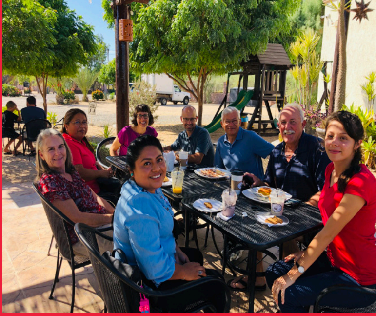
Missionaries and friends having fellowship in La Paz Mexico