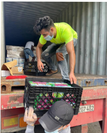
Cuba church volunteers unload the container

Please join us in thanking God for this opportunity and in praying that many lives in Cuba would be impacted for eternity through this tangible demonstration of His love and care.