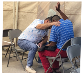
Prayer tent at Tijuana Brigada

There is no shortage of invitations from congregations who would like us to serve in their community. The Lord is opening doors to new locations and new Mexican partners. We have missed the blessing of working with a bicultural team of American and Mexican volunteers, and pray that the border soon opens completely so that the multicultural body of Christ can serve together again. In the meantime, we are excited for this growth as we wait expectantly to see how God will continue to work through the Tijuana Medical Brigadas.