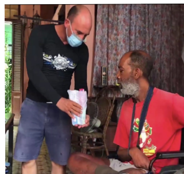
Man in Havana receives hygiene items